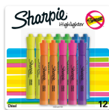
Highlighters (any color)