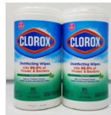
Clorox Wipes (2)