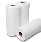
Paper Towels (2 rolls)