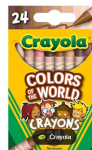
Colors of the world crayons