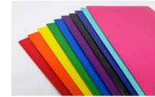
Pocket Folders (red, blue, green, yellow)