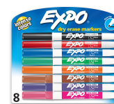
Expo Markers (fine tip)