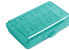
Plastic Pencil Case