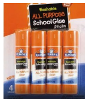
4 pack of glue sticks