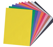
Construction Paper (1 pack)