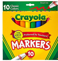
1 box of markers