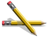
2 boxes of #2 Pencils (sharpened)